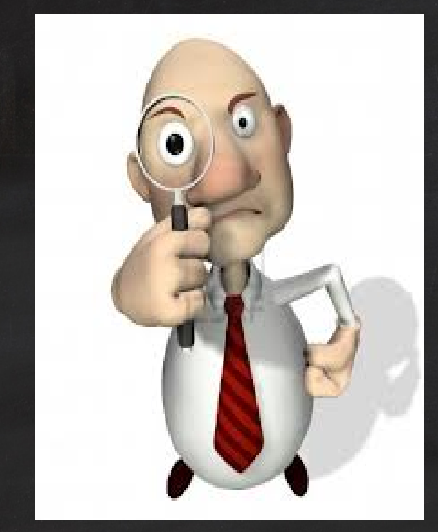
The Attorney General or County Attorney may INVESTIGATE.

ACTIONS taken by the Commission are NULL and VOID.