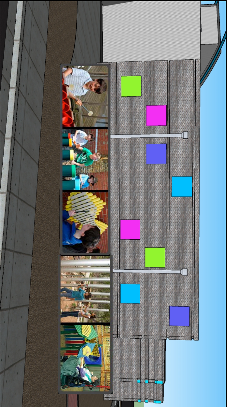
Xylophones along path and future LED panel treatments