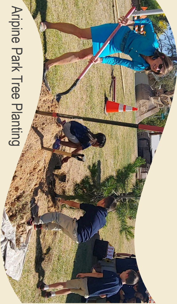
Ariprine Park Tree Planting