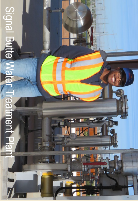
Signal Butte Water Treatment Plant