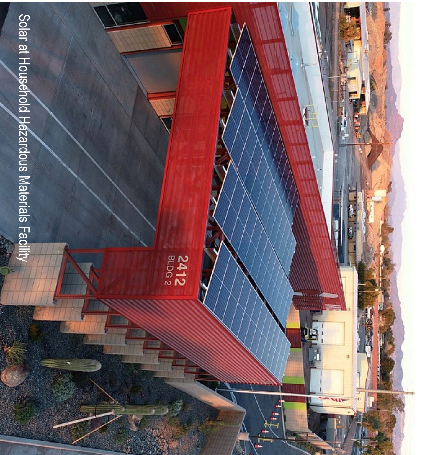
Solar at Household Hazardous Materials Facility