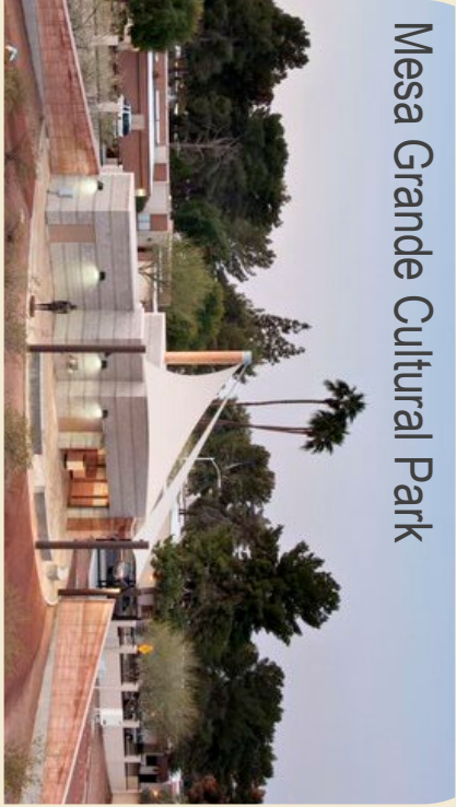
Mesa Grande Cultural Park