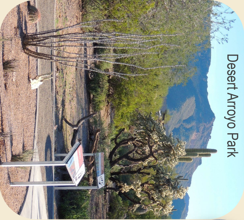
Desert Arroyo Park