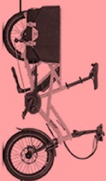
E - CARGO