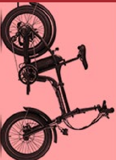
E - FOLDING