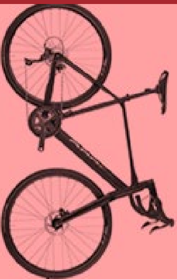
E - ROAD