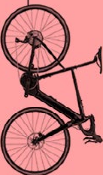
E - GRAVEL