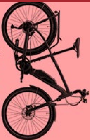
E - HYBRID