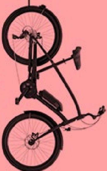
E - CRUISER