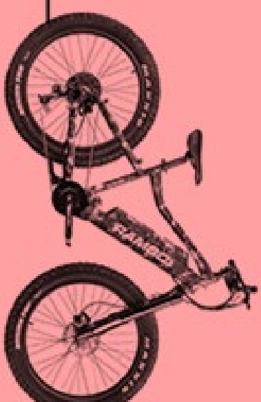
E - HUNTING