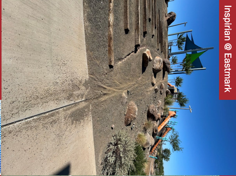
Inspirian @ Eastmark