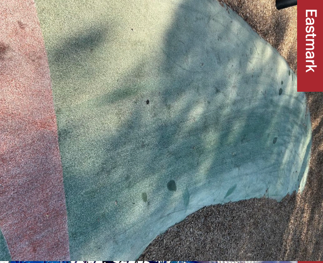
Inspirian @ Eastmark