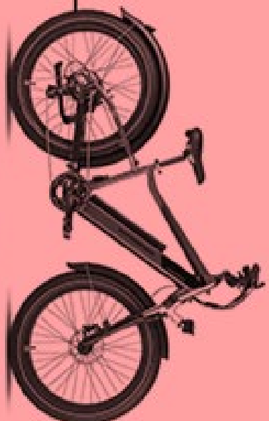
E - FAT