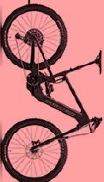
E - MOUNTAIN