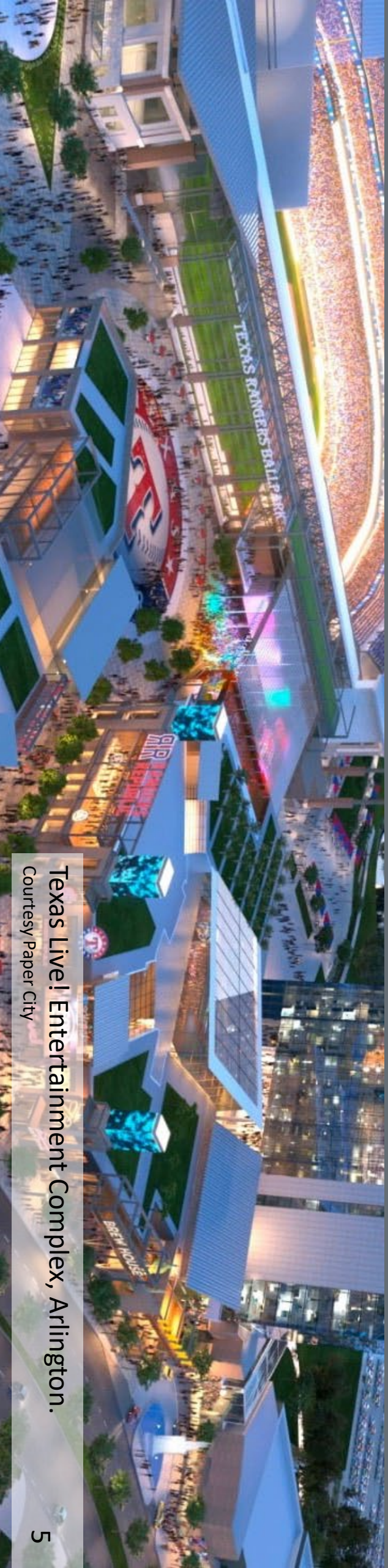
Texas Live! Entertainment Complex, Arlington.