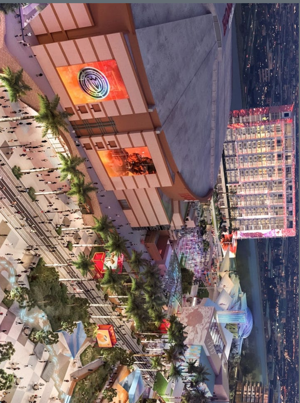
Proposed entertainment district. Honda Center, Anaheim California,

Courtesy Justin Byers, Front Office Sports, Sept 29, 2022